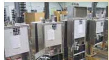
Type III Cabinet Assembly