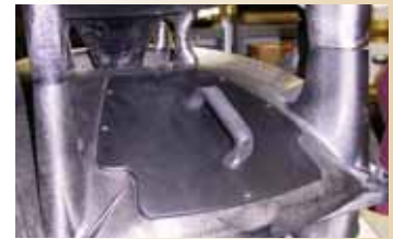
2900 Series Speakers Assembly