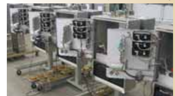
Type II Cabinet Assembly