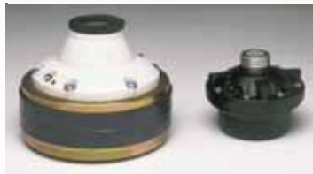
Whelen 400 Watt Speaker Driver shown with Standard 100 Watt Speaker Driver.