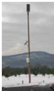
Whelen Model WPS2905 in the field on duty in Emmitsburg, Maryland.