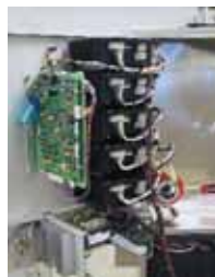
Type II Electronics Assembly detail.