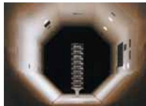
Whelen WPS2900 Series products are wind-tunnel tested to insure performance and reliability in the most trying conditions.